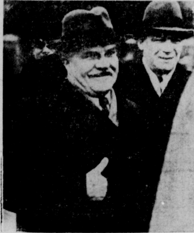
Soviet Foreign Minister Viacheslav Molotov boards his plane at Northout Airport in London, as he leaves for Moscow after the break-up of the Big Four meeting. Behind him is Soviet Ambassador Zurlubin. (NEA Radio-Telephoto).