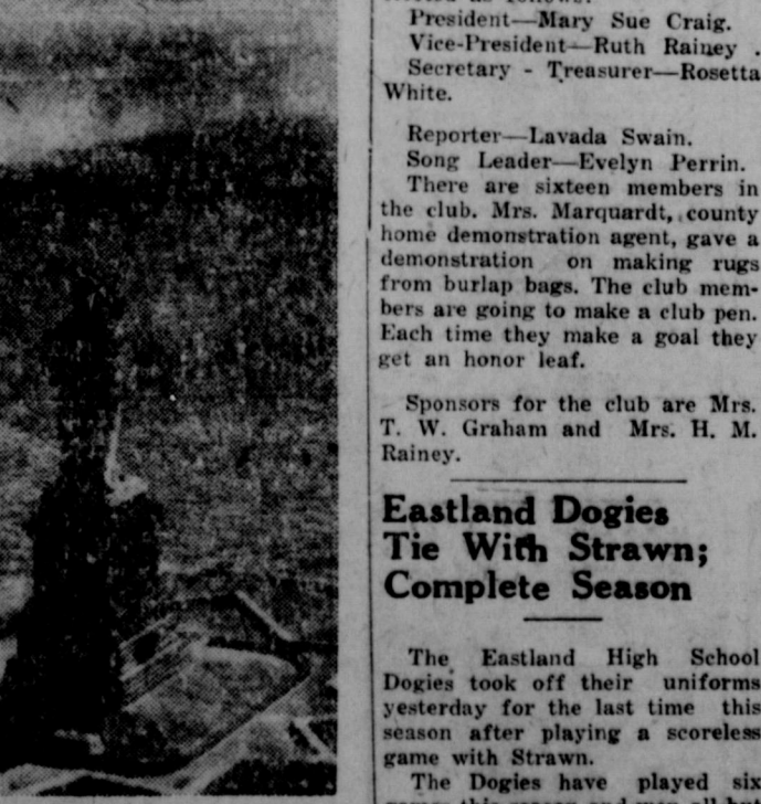
Airview of fireboats throwing plumes of water into the air in a salute as part of the Friendship Train, transported on barges at center, pass the Statue of Liberty.