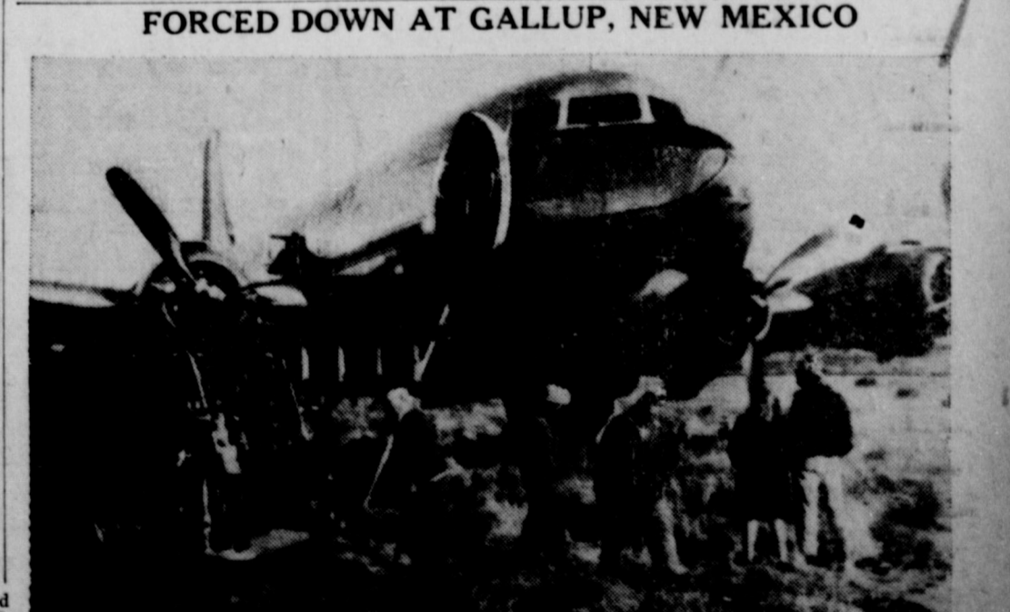
Gallup firemen pour chemicals into the belly of an American Airlines DC-6 which caught fire in the air near Gallup, New Mexico. The ship landed in time to prevent injury to the 25 persons aboard.