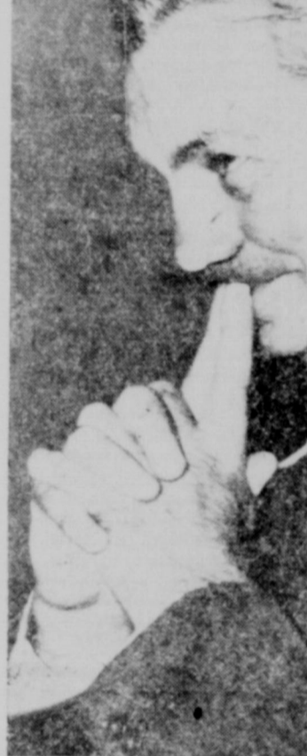
The newscamera catches usually grim-faced James V. Forrestal in apparently pensive mood. The Secretary of National Defense was awaiting his turn to testify before the Senate War Investigating Committee's probe of charges that the Roosevelt administration failed to mobilize the nation properly for World War II.

population in Puerto Rico are: under one year, 95 there compared with 43 in the U. S.; one to four years, 18 compared with two here; five to nine years, a ratio of three to one. Infant diarrhea is one of the chief causes of the high mortality among children, they said.