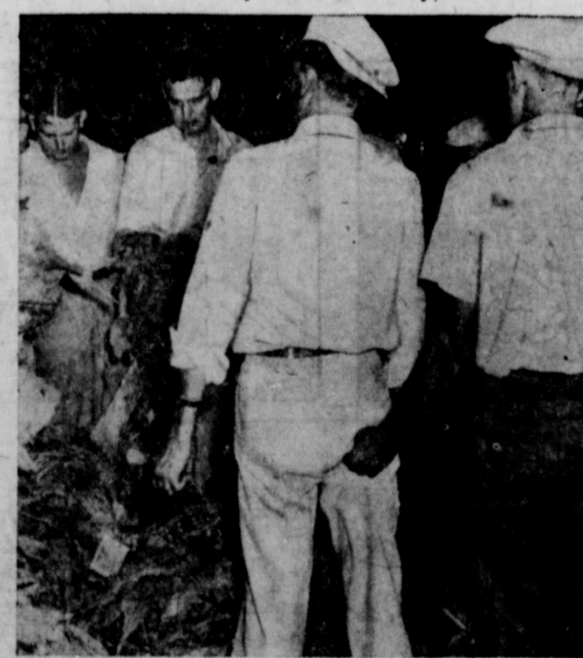
Uninitiated onlookers at south Georgia's bright leaf tobacco auctions are generally puzzled at what seems a complete lack of bids.