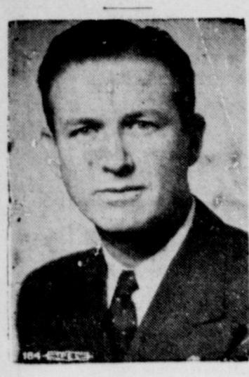
Candidate Issues Statement On Eve of Election

tion to any pressure group. No gress of my campaign in a par- fully representing the entire citi-