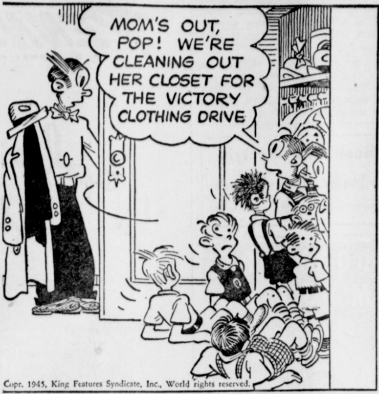
Copyright 1945, King Features Syndicate, Inc., World rights reserved.