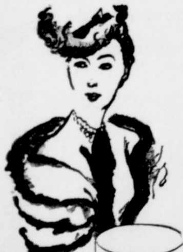
10th ANNUAL SAVINGS EVENT!