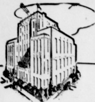
from the Court House