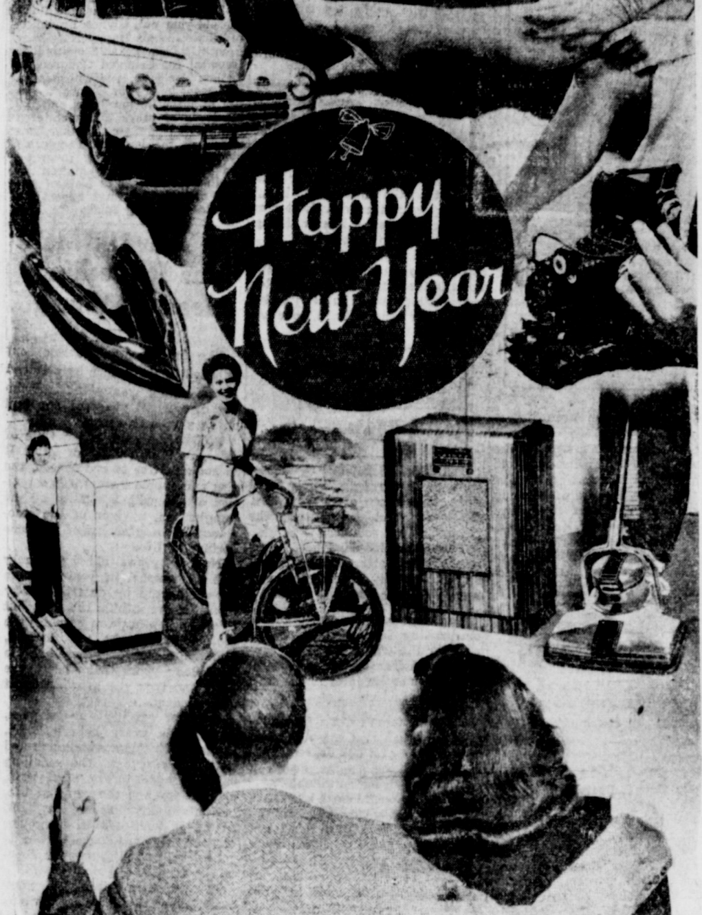
The new year is the one we've been waiting for-the year when reconversion will be completed and production brings realization of the war-years' dream of a new washing machi ator, car, bicycle, camera and whatnot—including NYLONS!