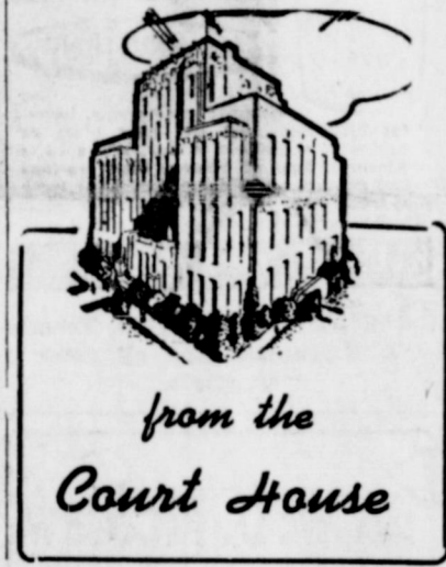
from the Court House

Other veterans who are interested in the program were asked to contact Fox in his office on the second floor of the Sinclair Prairie Building.