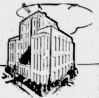
from the Court House