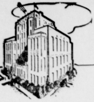
from the Court House

for record in the 91st District Court last week: