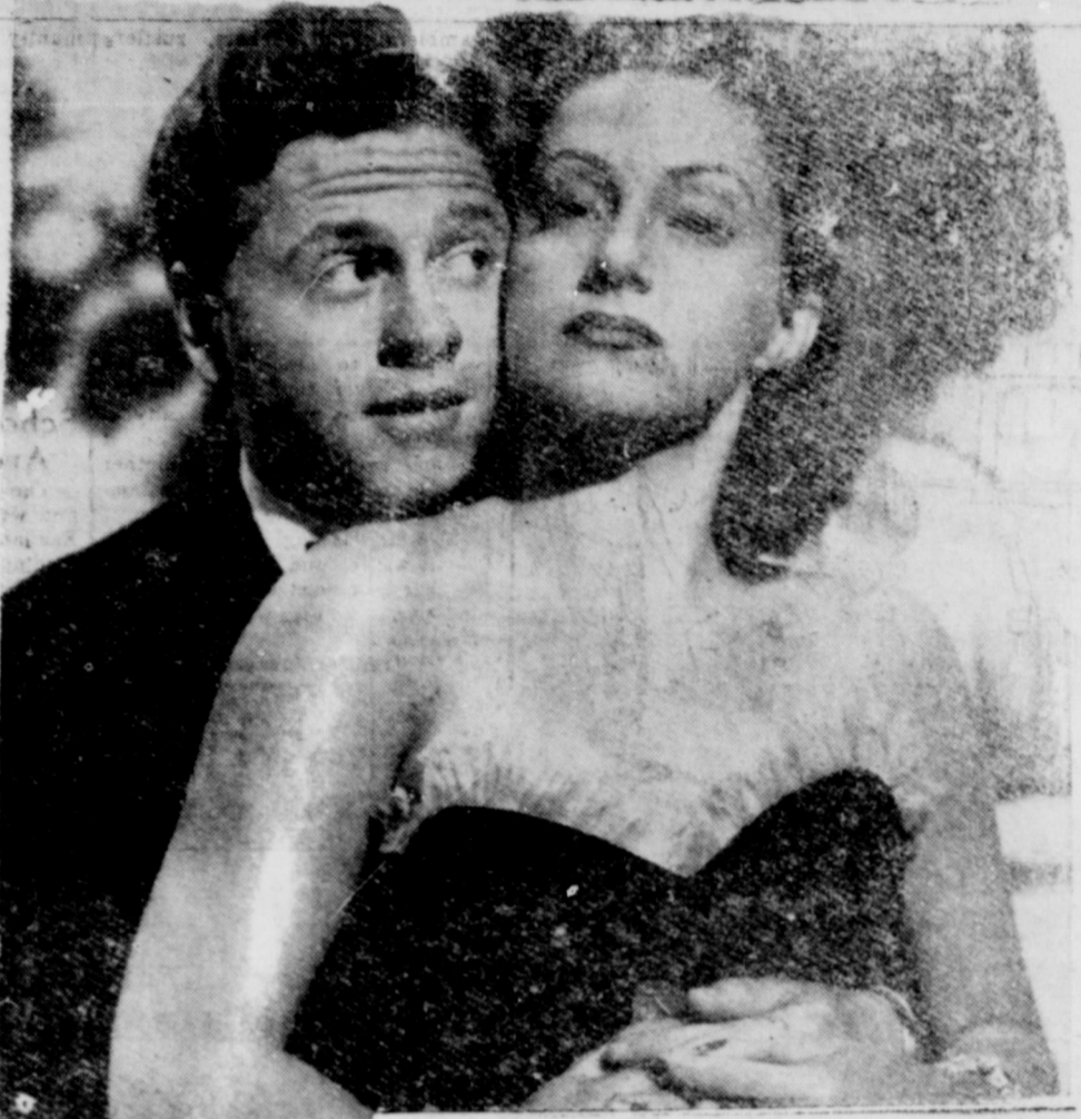
Andy together with the rest of the Hardy family is celebrating his third year as a screen character in "Andy Hardy Meets a Debutante." Mickey Rooney celebrates in poses with Judy Garland and Diana Lewis. "Andy Hardy Meets a Debutante" will be seen on the Lyric theatre screen here Sunday and Monday. The entire Hardy family, Lewis Stone, Sara Haden, Cecilia Parker and Fay Holden are in the picture as is Ann Rutherford, Andy's Carvel hometown girl.

By United Press INDIANAPOLIS, Ind. — Boys under 21 may not decide the national election this year but that doesn't mean they will not wield a powerful political bat in the future. For before summer is over, boys in 34 states will have held political elections of their own, waging heated campaign that will culminate in election of administrative, legislative and judicial officials in a mythical 49th state. Sponsored by the American Legion, the "Boys' State" idea is designed to train youths in civic responsibility and leadership and instruct them in the mechanics of American self-government. The boys start their 7- to 10-day regime with formation of political parties. These nominate candidates and announce platforms. The boys select all their officers from governor to constable, including the state legislature and judges of courts. After officials are installed, laws are enacted, taxes assessed and administrative details are worked out.