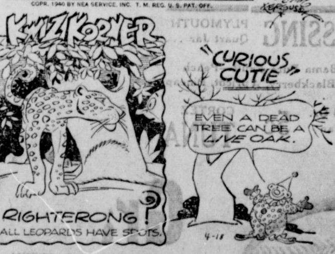
ANSWER: Right. Even black leopards have spots which can be seen against the luster of their coals.

non-fictional field and has, in fact, "more influence upon the countering cost of book publishing has afternoon, try" than any other form of writ-assured an increasingly larger ing today. "more influence upon the countering cost of book publishing has afternoon, assured an increasingly larger reading public able to buy books.