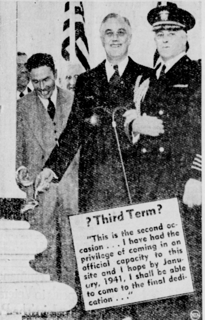
When President Roosevelt laid the cornerstone for the Jefferson Memorial at Fidal Basin, Potomac Park in Washington, he also laid the foundation for another flurry of third term speculation with his derogatory words. Did he mean he wants to come back as President, or as private citizen?