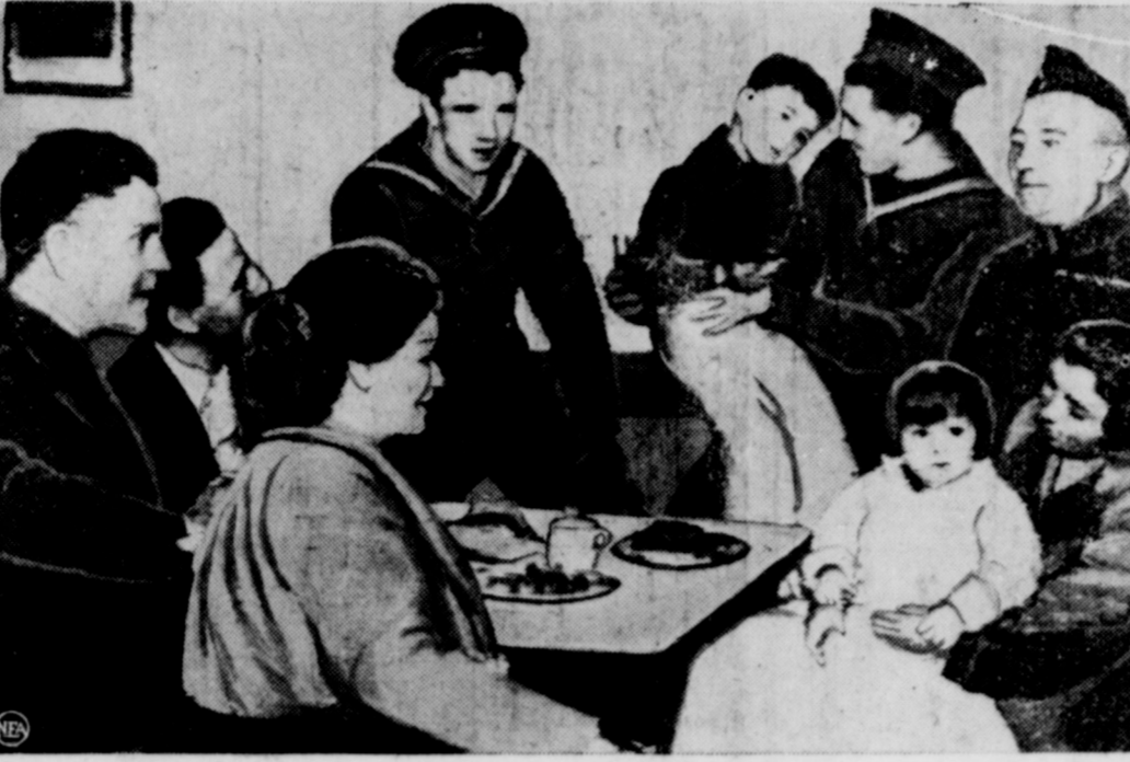
British bluejackets look on as welcome meal is enjoyed by survivors, including women and two children, of the French liner Bretagne, sunk by German submarine with loss of seven lives. They are shown after their arrival at Plymouth, England. Many of 124 passengers said only prompt rescue by British warships had prevented greater loss of life.