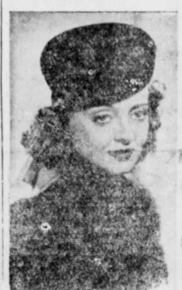
nn "Dark Victory" coming to th