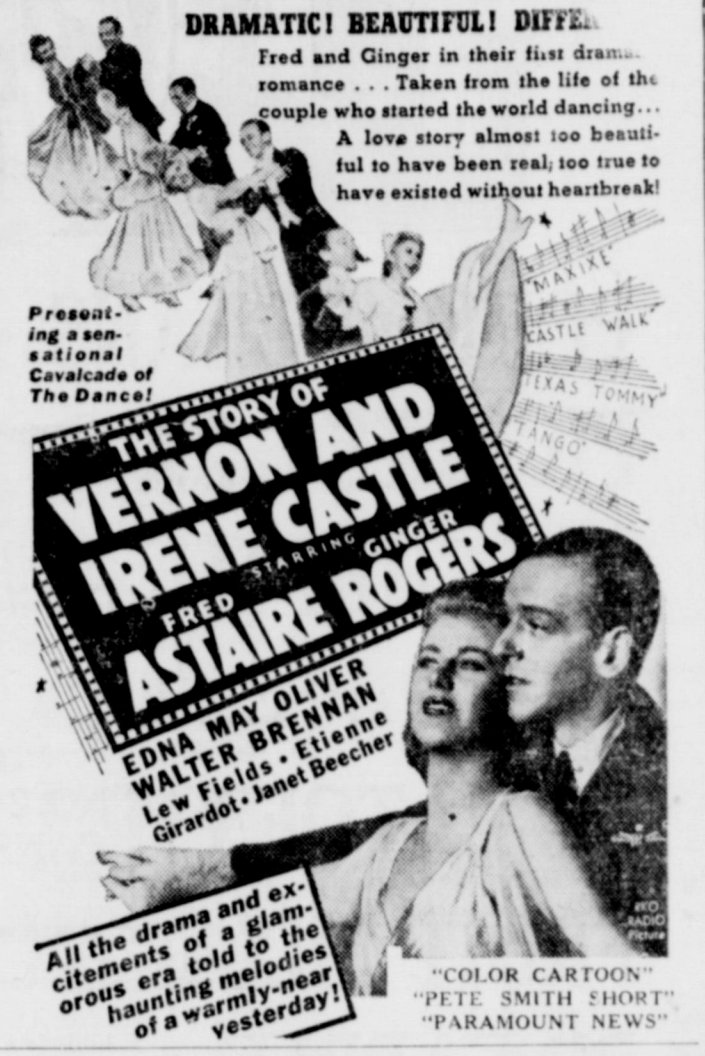
HIT NO. 4 — THURS. — 15c DAY

A SCANDALOUSLY JUNNY PICTURE ABOUT 'MISTER AVERAGE MAN'!