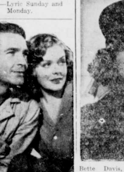
Lyric May 16th - 17th.