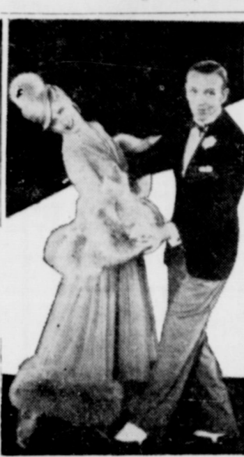
Castle"-Lyric Sunday and