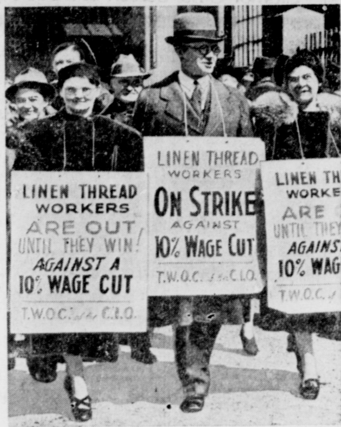
Representative Fred Hartley, center, of New Jersey, is pictured carrying a strike poster, as he led strikers picketing a thread factory at Kearny, N. J.