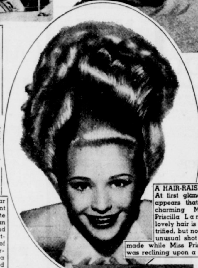
A HAIR-RAISER —At first glance it appears that the charming Miss Priscilla Lane's lovely hair is electrified, but no, this unusual shot was made while Miss Priscilla was reclining upon a sofa.