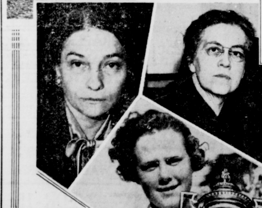
IN THE FEMININE WORLD —(1) Mrs. Elizabeth Smith Friedman, America's only woman cryptanalyst, who recently helped break up one of the biggest smuggling rings on the Pacific Coast, by translating twenty-seven Chinese code cablegrams. (2) Mile. Nadia Boulanger, who will be the first woman ever to conduct the Boston Symphony Orchestra. (3) Miss Patty Berg, 19-year-old Minneapolis golfer, who has won the Grace Doherty trophy for the third consecutive year.