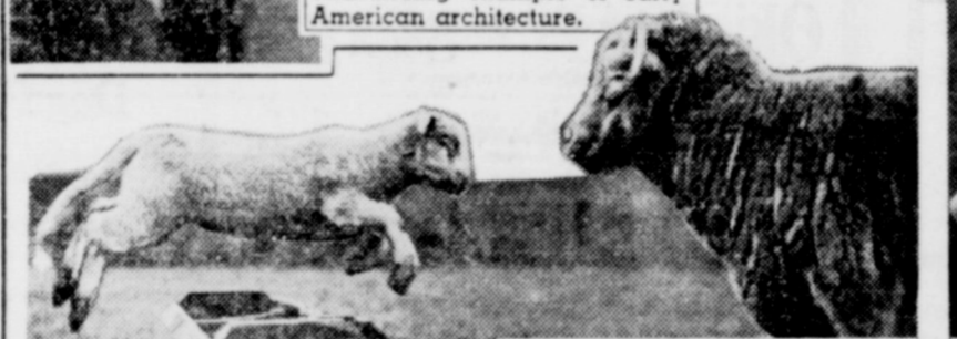
HURDLING LAMB —Farm workers of Westerham, Kent, England, are amazed at the ability of this lamb to hurdle obstacles in its stride.