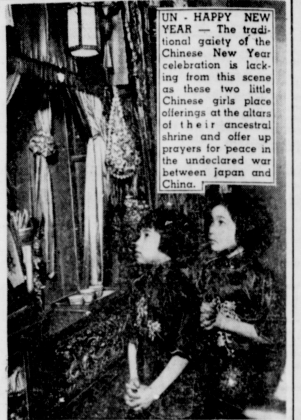
UN - HAPPY NEW YEAR —The traditional gaiety of the Chinese New Year celebration is lacking from this scene as these two little Chinese girls place offerings at the altars of their ancestral shrine and offer up prayers for peace in the undeclared war between Japan and China.