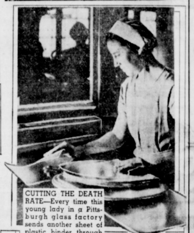
CUTTING THE DEATH RATE —Every time this young lady in a Pittsburgh glass factory sends another sheet of plastic binder through the washer, she's helping to prevent serious auto accidents, according to Consumers Information. This plastic forms the center layer in safety glass now used in all American cars, and prevents the flying fragments which once caused many deaths—another example of how industry tries to protect the consumer.