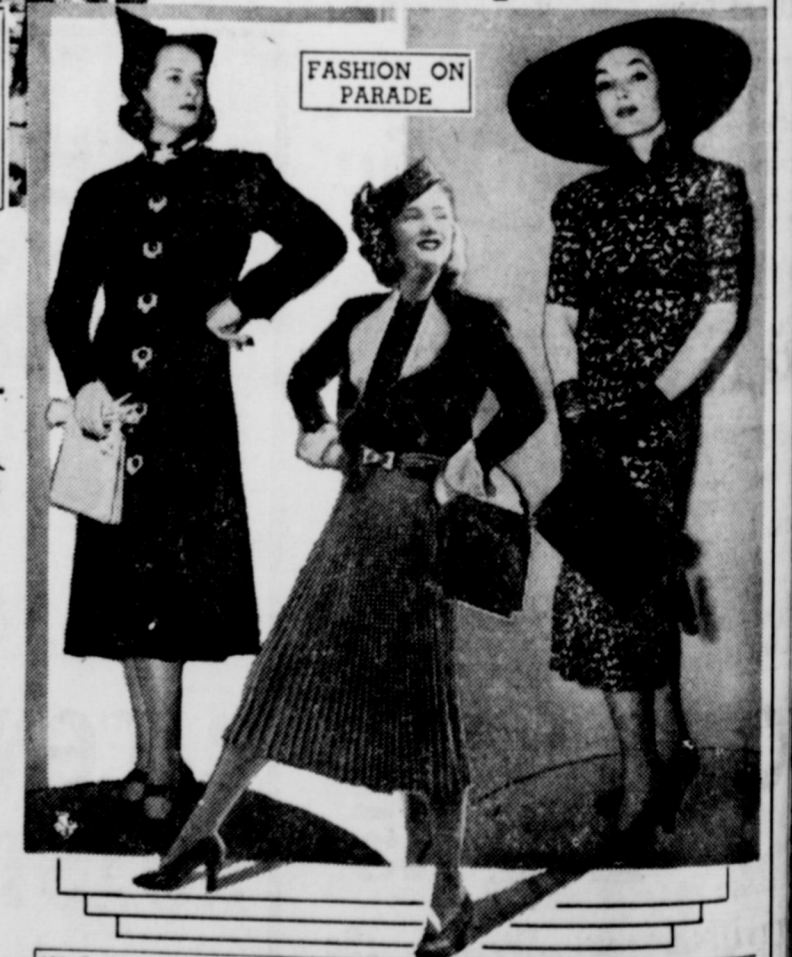
FASHION ON PARADE