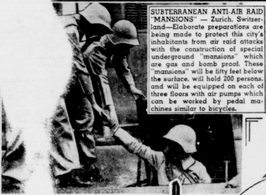
SUBTERRANEAN ANTI-AIR RAID "MANSIONS" —Zurich, Switzerland—Elaborate preparations are being made to protect this city's inhabitants from air raid attacks with the construction of special underground "mansions" which are gas and bomb proof. These "mansions" will be fifty feet below the surface, will hold 200 persons, and will be equipped on each of three floors with air pumps which can be worked by pedal machines similar to bicycles.