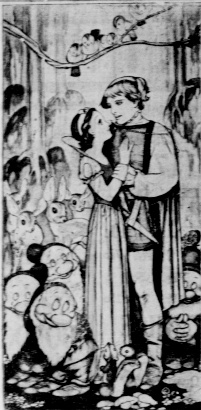
COMING TO LYRIC FRIDAY, APRIL 8th First Showing in this Section "SNOW WHITE and the SEVEN DWARFS"

The store is the latest unit of the Lion Automotive Parts and