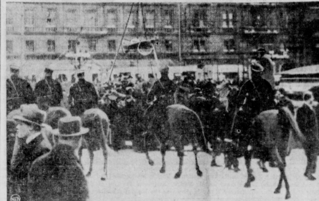
When Chancellor Kurt Schuschnigg finally capitulated before the iron-fisted ultimatum of Hitler, Nazis who previously had been rioting burst into a wild celebration such as pictured in the striking photograph above. Mounted police found their job almost as difficult as during the earlier street clashes, so riotous were the demonstrations of the victorious Nazis. Similar scenes were enacted all over Austria.