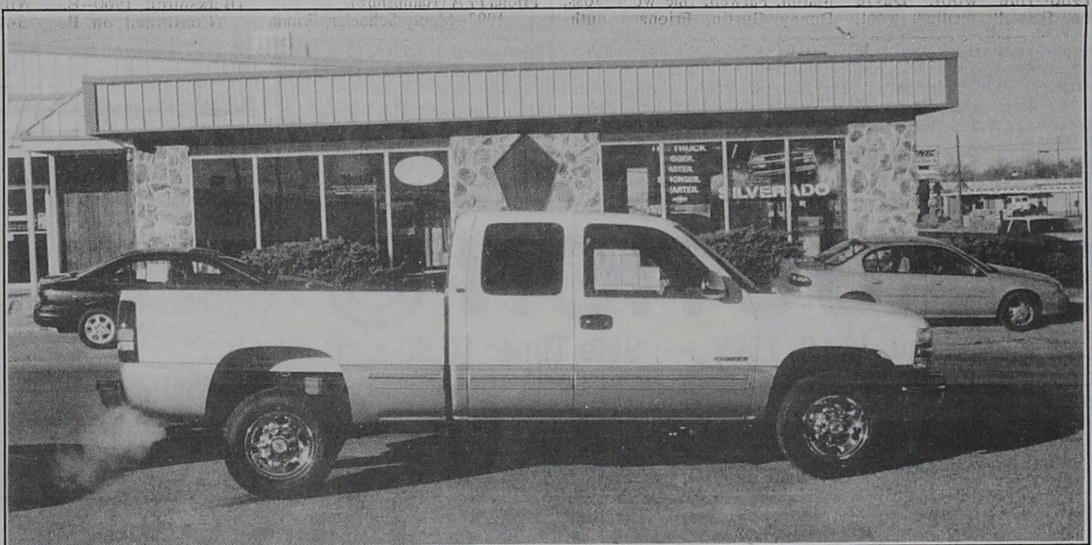
STK# 10135 • HARD TO FIND • 3/4 Ton • NEW BODY STYLE • 1999 Silverado LS Package

Come See Our Bargains on New 1998 & 1999s