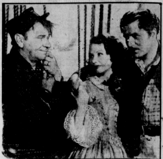
Wallace Berry, Warner Baxter and Elizabeth Allen in "Slave Ship" showing Friday and Saturday at the New Lyric Theatre.