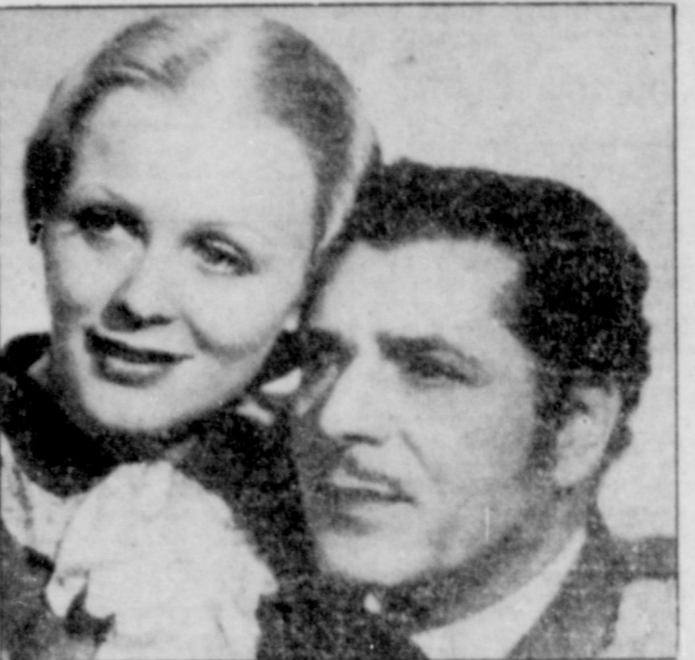
Martyred to a nation's frenzied hate, doomed to die on an island hell, he fights to live only because of this woman's love! Warner Baxter and Gloria Stuart enact the leading roles in 20th Century's daring dramatization of the most tragic story in American history, "The Prisoner of Shark Island."

ponding period last year, but aggregate capitalization was slightly above, the Bureau's report said.