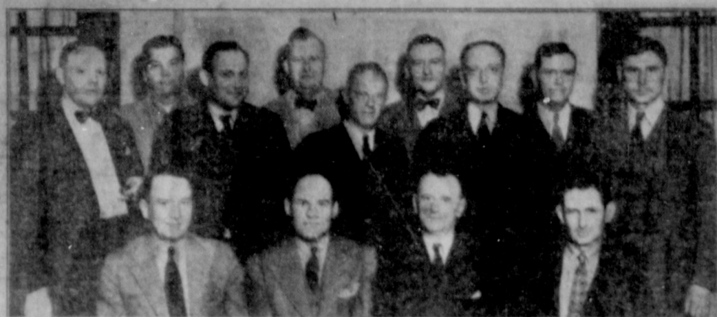
To prepare for the West Texas Chamber of Commerce convention, May 11-13, in Amarillo is the task confronting this group. More than 200 Amarilloans are on committees arranging for the 18th annual meeting of the large regional organization...