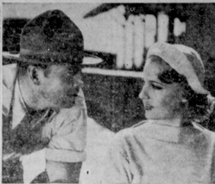
George O'Brien is a railroad hero in his latest Fox adventure picture, "Whispering Smith Speaks," riding roughshod over the menace that threatens Irene Ware, the girl he loves, showing Friday at the Arcadia Theatre.