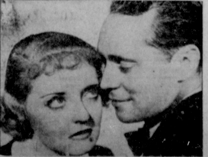
Franshot Tone returns as the partner to Bette Davis in "Dangerous," which is playing Sunday and Monday at the Arcadia.