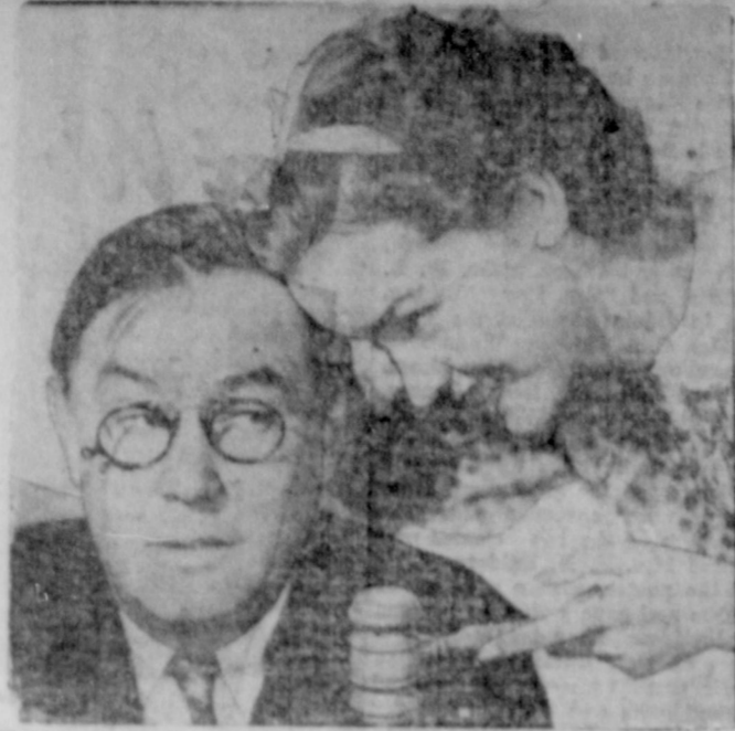
Walter C. Kelly and Marsha Hunt coming to the Arcadia Theatre Friday, playing in "The Virginia Judge."