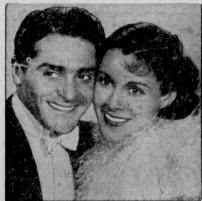
Starred in Fox Film's "The Gay Deception," Francis Lederer and Frances Dee discover that it's fun to be fooled. They are the gay deceivers of this light-hearted comedy, and when they finish pretending to be what they aren't they find themselves in each others' arms and intoxicatingly in love, playing Tuesday only at the Arcadia.