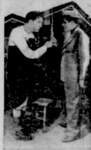
Edward Everett Horton and Jack LaRue in "His Night Out," which shows in connection with the Hollywood Premiere Saturday, 11:00 p. m., at the Arcadia.

gram and letter from the office of Sen. Morris Sheppard of his appointment as certifying officer of the Resettlement Administration which was discontinued Sept. 15.