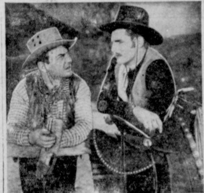
Larry "Buster" Crabbe, in a scene from the Paramount picture, "Nevada," coming to the Columbia Theatre, on Saturday. Kathleen Burke, Raymond Hatton and Monte Blue are also seen in this film.