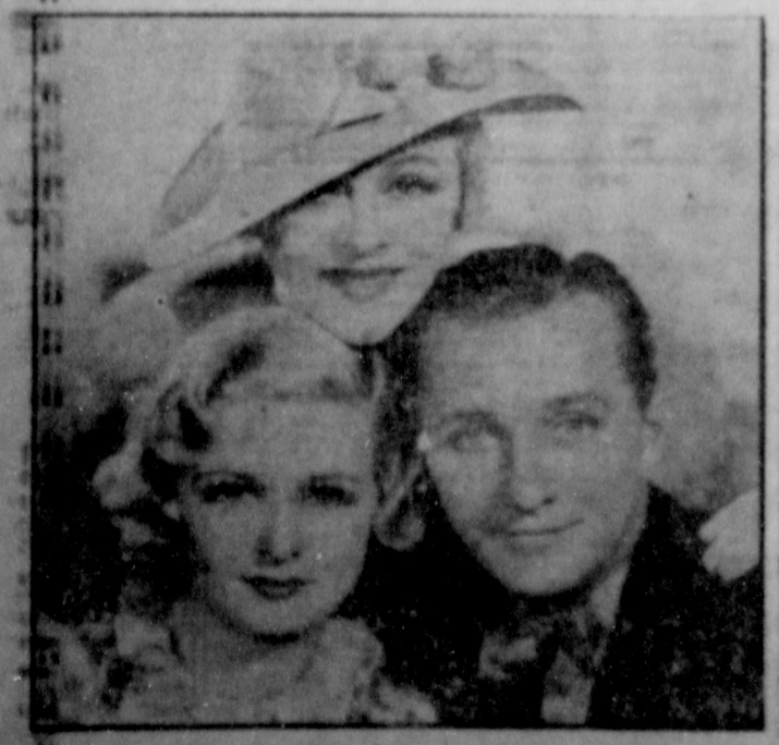
Mary Boland apparently approves the love light in the eyes of Bing Crosby and Joan Bennett in the crooner's new Paramount comedy "Two for Tonight," with five song hits, to open Monday and Tuesday at the Arcadia Theatre. Frank Tuttle directed. Lynne Overman and Thelma Todd are also in the cast.

and ex-theatrical producer, to go out and make things happen to get more material for his play. He starts an hilarious seltzer water-siphon-shooting battle in a night club which sends him to jail. By this time Miss Bennett has fallen in love with the romantic tenor, but runs away when she sees him in an embrace with Miss Todd, rehearsing a love scene. Overman, suddenly returning from Europe, also sees them, and fires Bing.