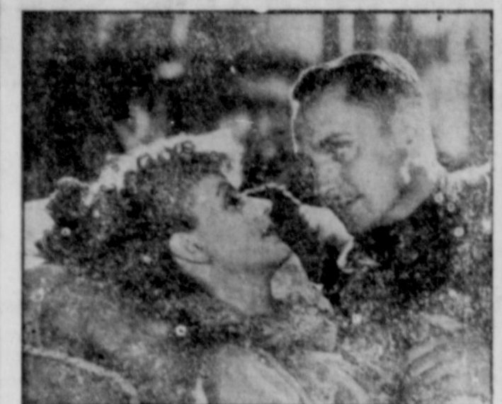
Garbo gives an unforgettable characterization as heroine who has to choose between giving up her child and the man she loves—Clarence Brown's direction and photography are flawless. The Arcadia gets this film Saturday.