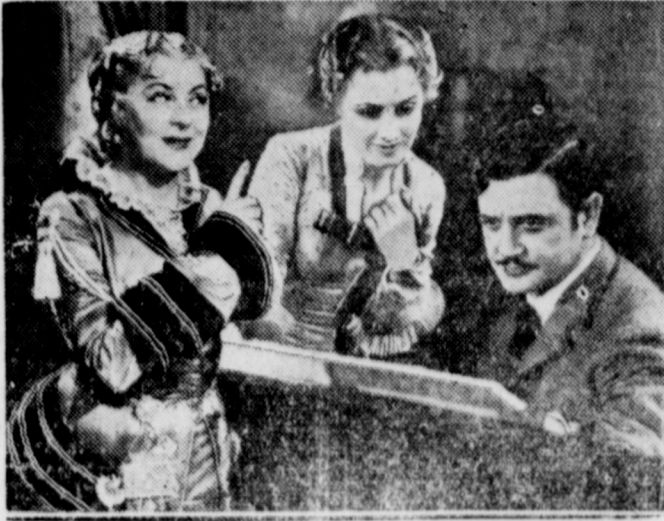
Richard Dix as the bandit in the title role of "Stingaree," RKO-Radio Picture, invades the home of an opera aspirant (Mary Boland) and discovers that the real prodigy is Irene Dunne, a poor dependent.