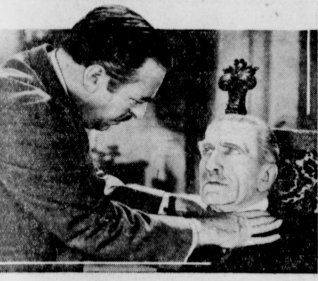
"I'd like to break your neck!" said Bill. (Walter Connolly-C. Aubrey Smith)

continued hastily. "Nothin' I can't take care of, but it would help a lot if I could feel happy about you..."