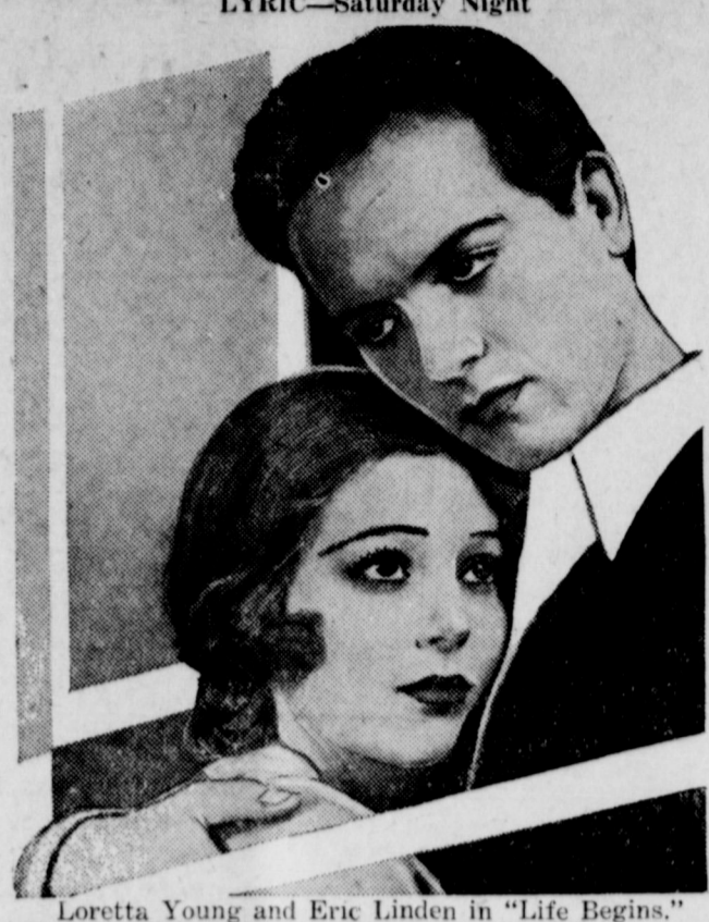
Loretta Young and Eric Linden in "Life Begins."

EYES depend on Health for fullest Beauty When your eyes suffer from strain they lose their charm. Restore their sparkle with well-fitted glasses.