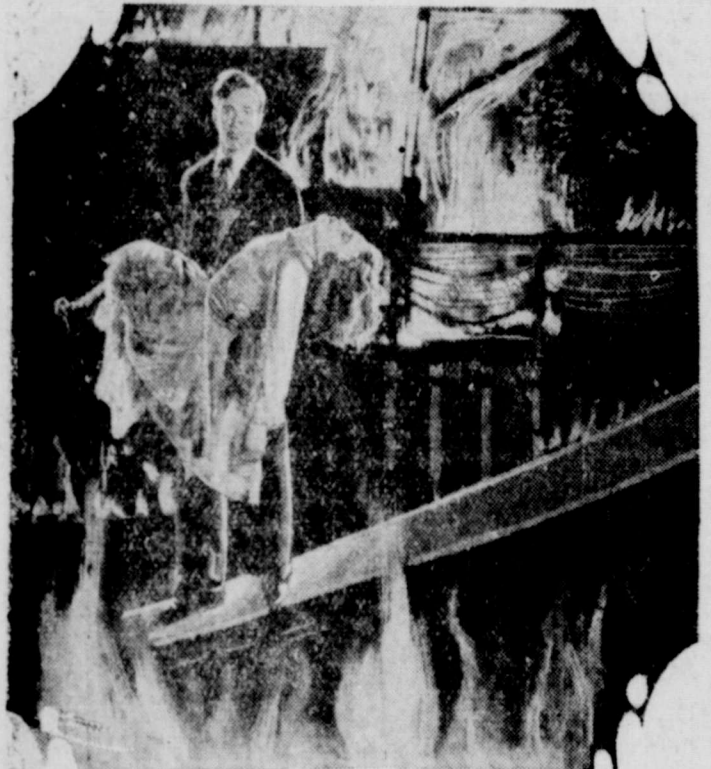
He stumbled through the burning building, carrying the unconscious girl to safety.