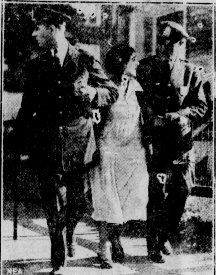
While throngs of strikers and strike sympathizers set up a chorus of jeers, Pawtucket, R. I., police arrested ten persons during a recent demonstration outside the Royal Weaving Company mills. This picture shows one woman striker being led from the scene.