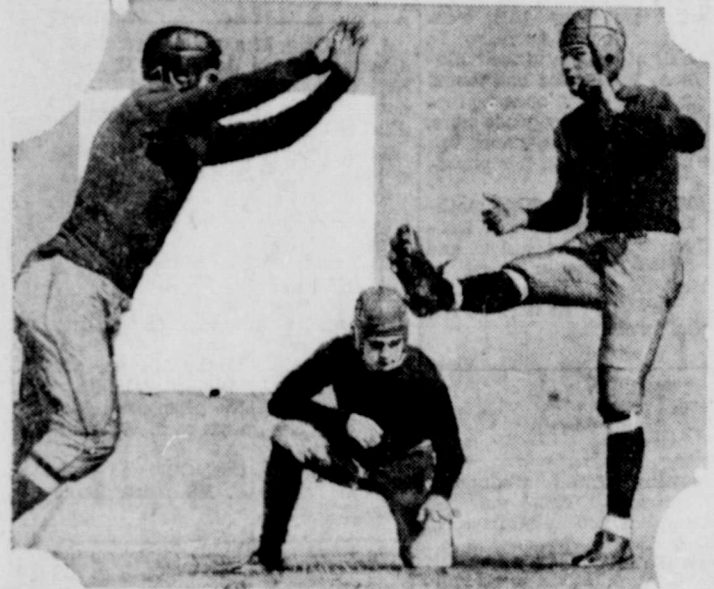
Then Bob Kicked. The ball took the air and sailed over the goal post.

In her apartment Evelyn Palmer sat powdering her face. Nearby was her chum, Peggy.