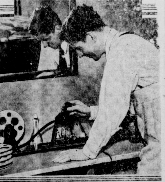
Improve your spare time, was the advice given by Rudy Vallee to the employees of the Paramount Theater of New York this week when he addressed the regular meeting of their Pop club. He improves every moment of spare time in his strenuous day which begins at 9 o'clock in the morning and does not end before 2 or 3 the next morning, ever making his own motion pictures of his orchestra in action in order to improve its stage appearance.