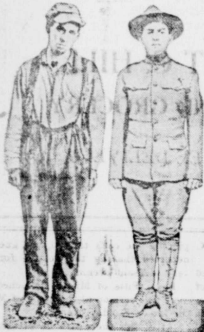
AFTER FIVE MONTHS.