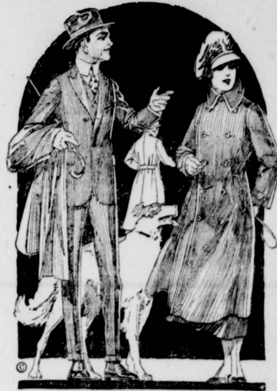
Asie from this, our line of samples for Tailor made clothes is as good as the best, and better than the rest.

Adding to everyday will finally build up. We have been adding new lines and bigger lines to this store every since we purchased it. We can supply you with anything a man needs to wear. Dealing exclusively in men's wearing apparel, we study nothing else, we buy nothing else, therefore every peice of merchandise we have was closely studied and bought right. Just come in and look it over, and see a real up-to-the-minute stock of Gents Furnishing.