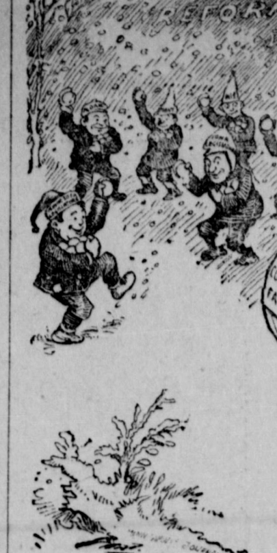
The Legislative Lads have Some Reform Snowballs Ready For Him.