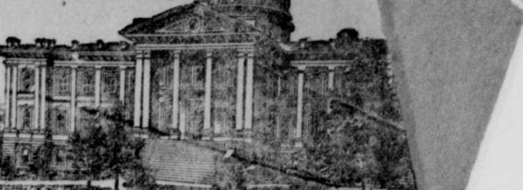
CAPITOL BUILDING, SALEM, OREGON.