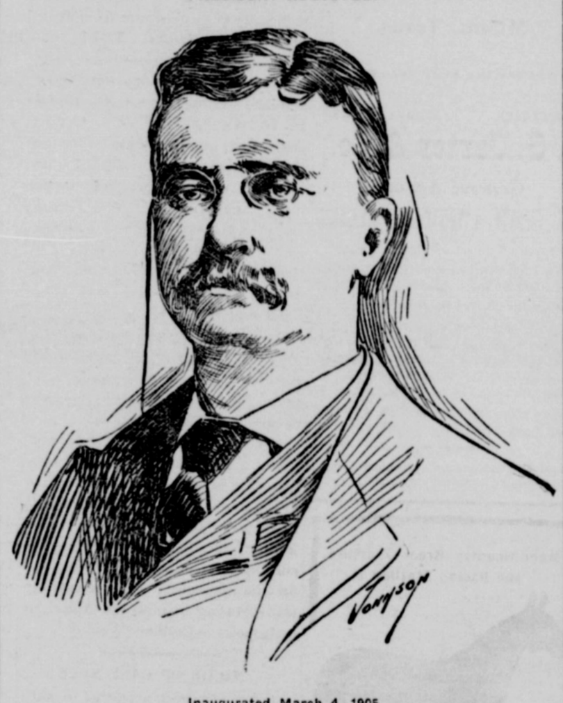
Inaugurated March 4, 1905.

The full text of President Roosevelt's inaugural address, delivered on March 4, 1905.