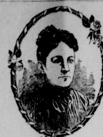
A Professional Nurse Tells Her Experience With Doan's Kidney Pills.