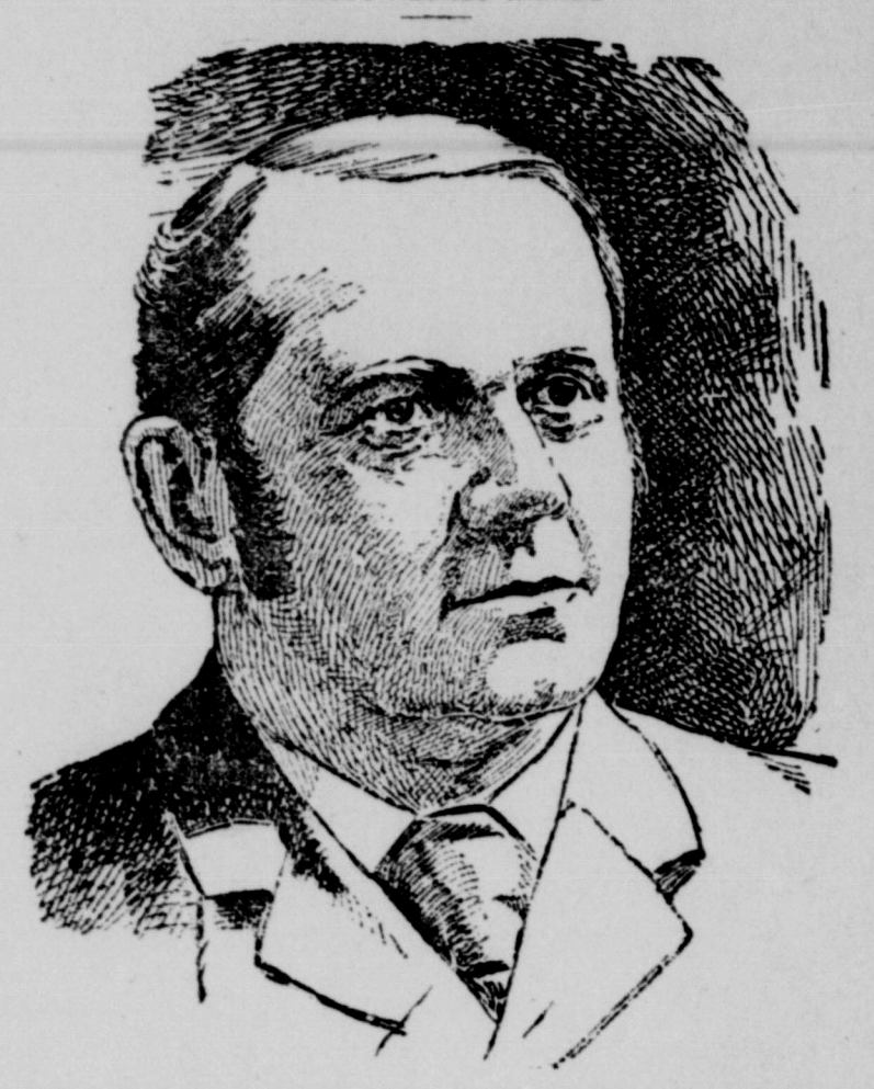
MARCUS ALONZO HANNA.

United States Senator from Ohio, born at New Lisbon (now Lisbon), Ohio, Sept. 24, 1837. Has lived in Cleveland since 1852. Is head of the firm of M. A. Hanna & Co., coal dealers; director Globe Ship Manufacturing company; president Union National bank; president Cleveland City