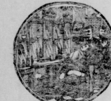
Dan Kivlehen, —TONSORIAL ARTIST— Miami, Texas.

The influence of climatic conditions in the cure of consumption is very much overdrawn. The poor patient, and the rich patient, too, can do much better at home by proper attention to food digestion, and a regular use of German Syrup Free expectorating in the morning is made certain by German Syrup, so is a good night's rest and the absence of that weakening cough and debilitating night sweat. Restless nights and the exhaustion due to coughing, the greatest danger and dread of the consumptive, can be prevented or stopped by taking German Syrup liberally and regularly. Should you be able to go to a warmer climate you will find that of the charms of consumption there, the few who are benefited and regain strength are those who use German Syrup. Trial bottle 25c; regular size 50c. At all druggists.