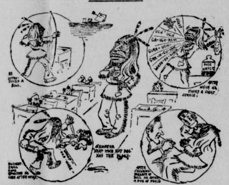
A section of Senator Quay's territorial bill provides that one of the senators representing the territory shall be of Indian descent.