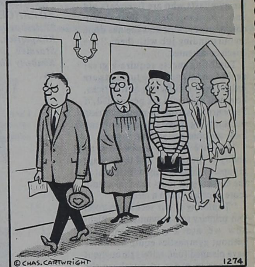
"He hides his Christian qualities, for fear others will take advantage of him!"