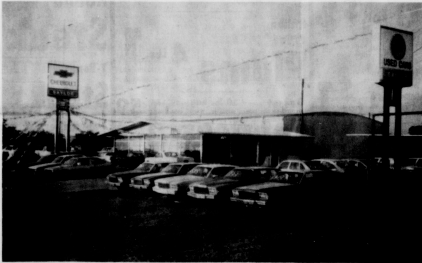
Remember our name. We're going to do our level best to see that it's around a long time—with the kind of deals, salesmanship and service that keep customers happy. Drop by and see the good things going on beyond that bright new sign on our door.