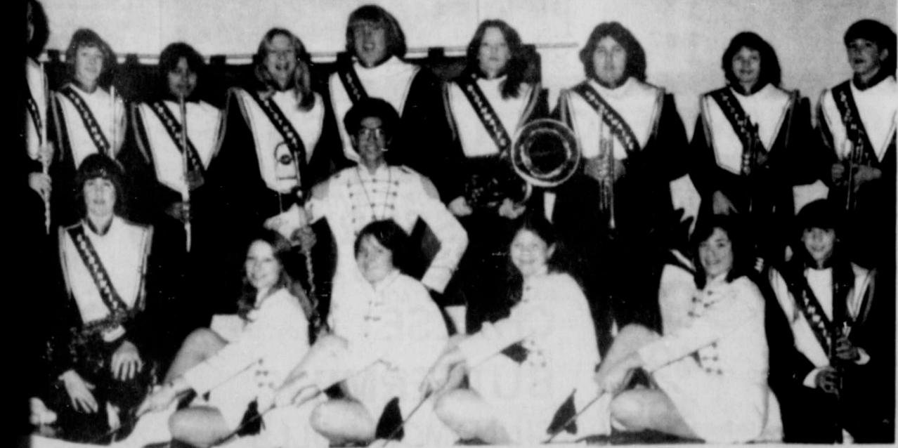
First Division Players

The Tax Office has stated that if taxes are not rendered by April 30, your last year's rendition value will be used.