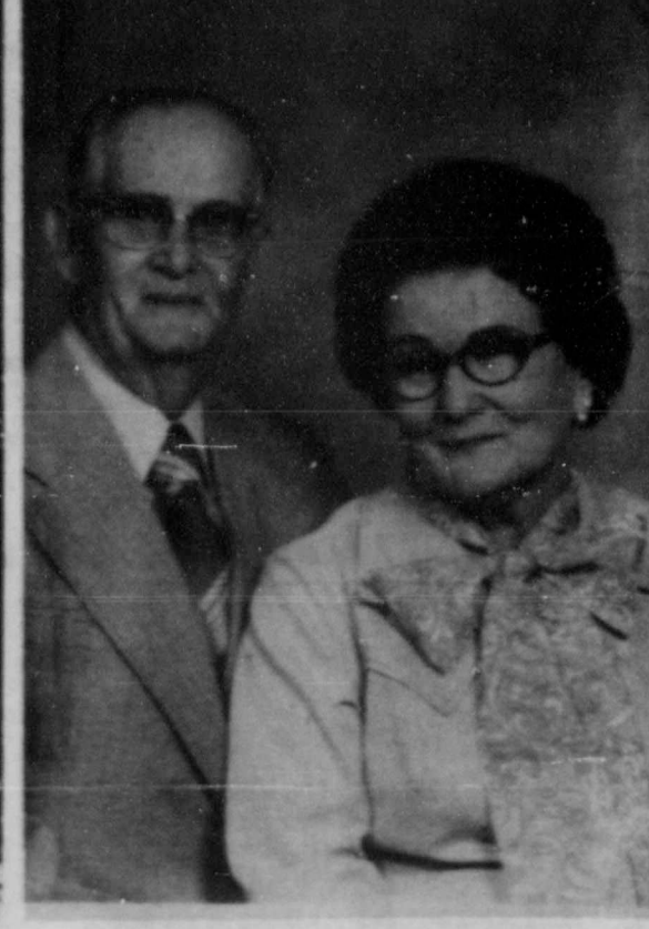
January 14, 1978