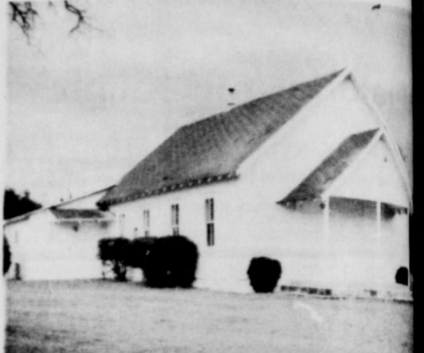
LONG COVE BAPTIST CHURCH