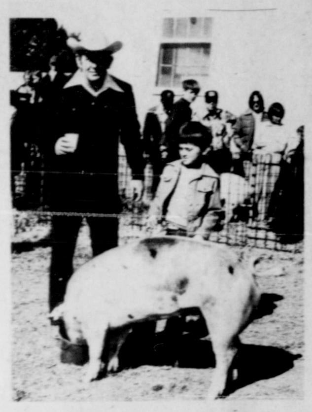
CHAMPION BREEDING GILT -