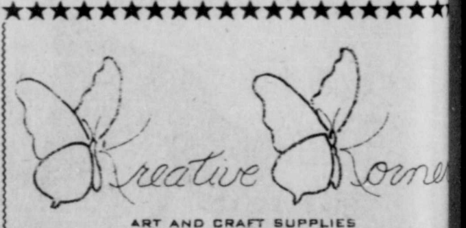
Class Schedule For Feb.

Beginning Feb. 3 for four weeks Beginning Ceramics