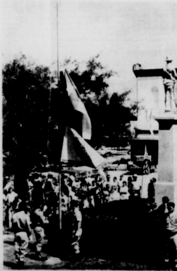
FLAGS RAISED - - The flag-raisers from Fort Hood slowly raise the Texas Flag and the Mills County Bicentennial Flag following their presentation by

***** MUCH, MUCH MORE! - - The above photographs paint only a very small picture of the Ceremony and Fiddlers' Contest and Festival. There were antique autos, good barbeque and fried fish, free balloons, swimming for the kids, stirring speeches, flags on Fisher Street, and one of the most impressive to home-towners and visitors alike was the friendly, warm-hearted spirit of the day. It will live for a long time. *****