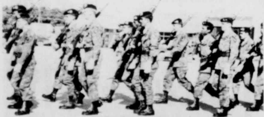
HONOR GUARD - - This contingent of about 20 Fort Hood soldiers were the official Hon-