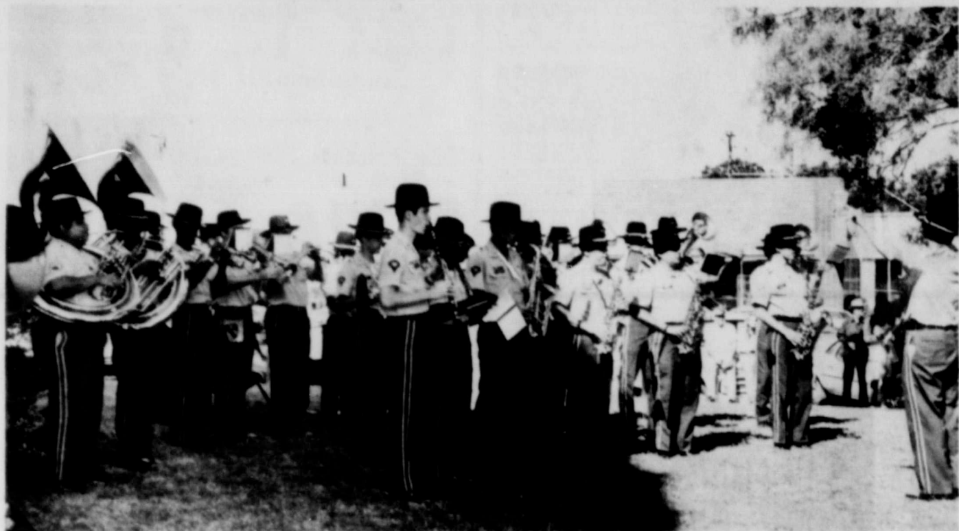
FIRST CAVALRY BAND - - This group of Army musicians stirred the chords of patriotism in the hearts of those who

attended the Bicentennial ceremony Saturday morning. There is just something indescribable about the way 35 grown men