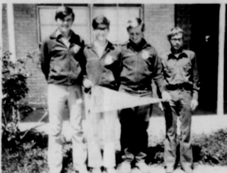
The Mullin FFA quiz team placed 1st in district at the leadership contest at Lampasas. Members of the team are,