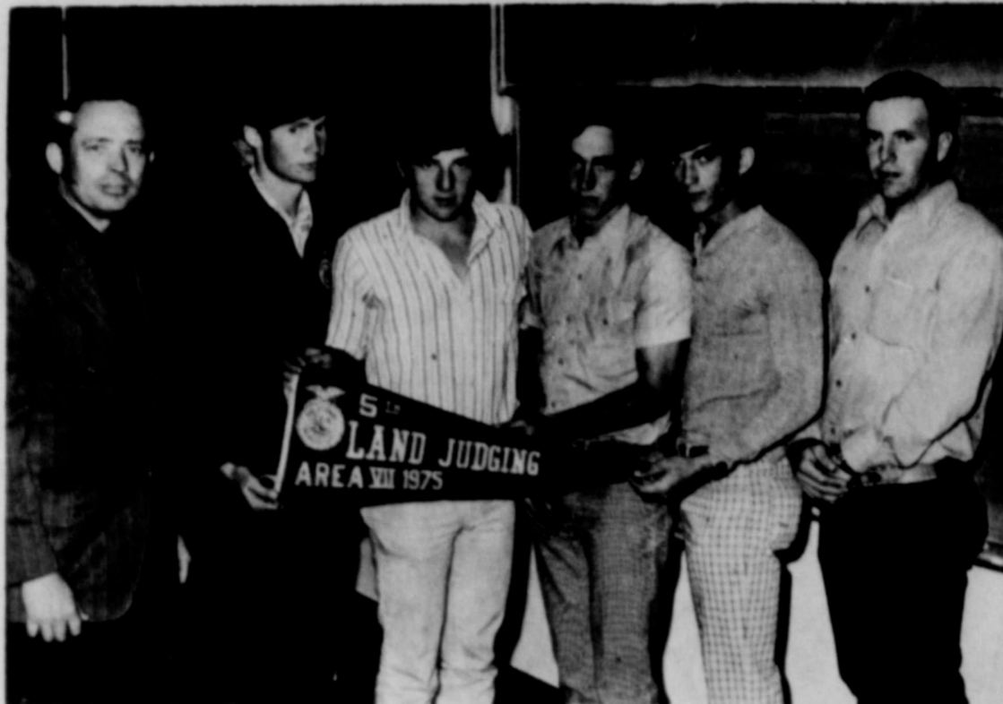
A Future Farmers of America Land Judging team from Mullin took fifth place in the Area VII contest held recently at