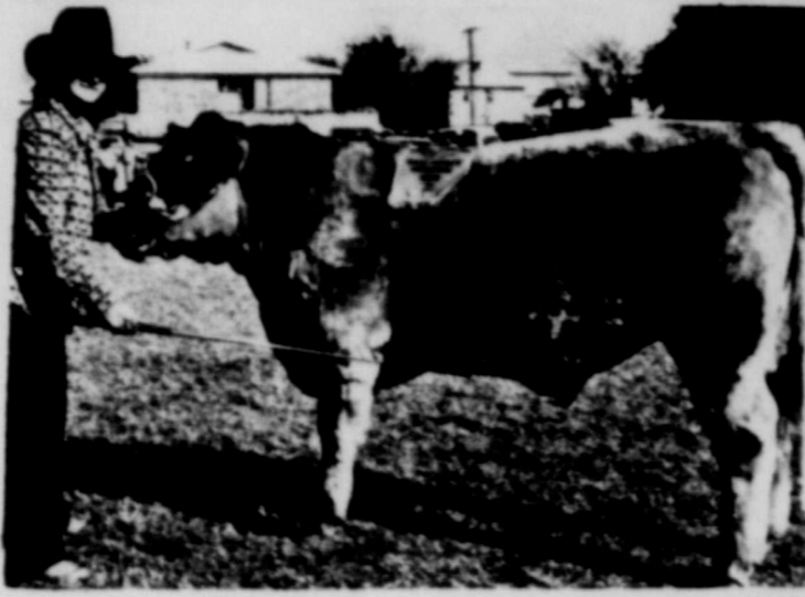
Bridget Meier shown with the reserve champion market steer.