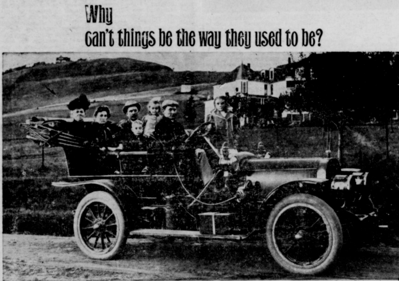
Why can't things be the way they used to be?