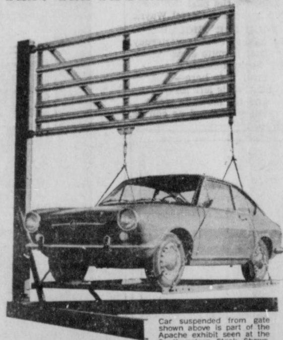
Car suspended from gate shown above is part of the Apache exhibit seen at the Southwestern Stock Shows.

Put Apache long-service features to work for you—Exclusive full-hard spring steel for the ultimate in durability. Hot-dip galvanizing to prevent corrosion. Tubular slide latch for ease of operation. Squeeze-activated joints for maximum holding power. Bearing-type, Pressed Steel Hinges for effortless movement and life-of-the-gate service.