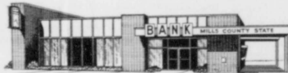
MILLS COUNTY STATE BANK GOLDTHWAITE, TEXAS 76844