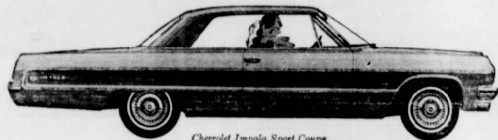
Chevrolet Impala Sport Coupe

These district meetings are for the purpose of nominating one or more candidates for director from each district. You will vote on these, electing one from each district at the annual meeting, October 5, 1964.