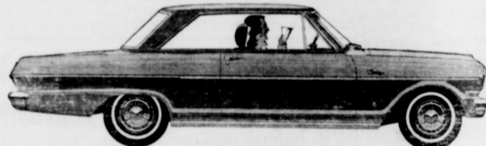
Chevrolet Nova Sport Coupe