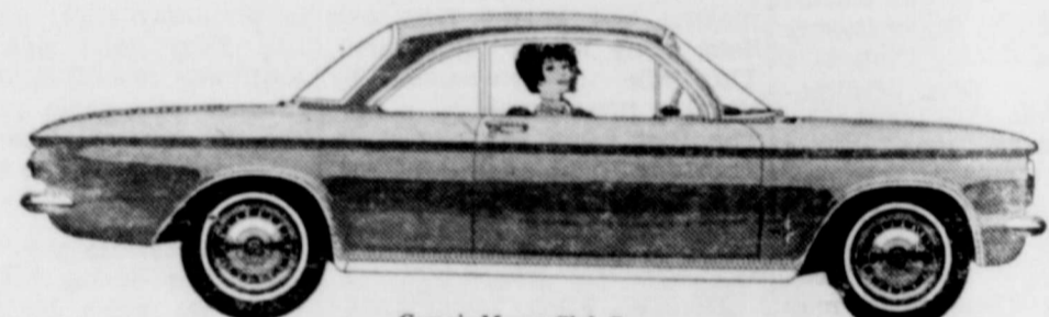
Corvair Monza Club Coupe

America's best sellers... Your best buys! Now at your Chevrolet Dealer's