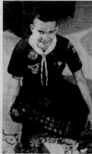
YOUNG TEXAN FOR NOVEMBER—