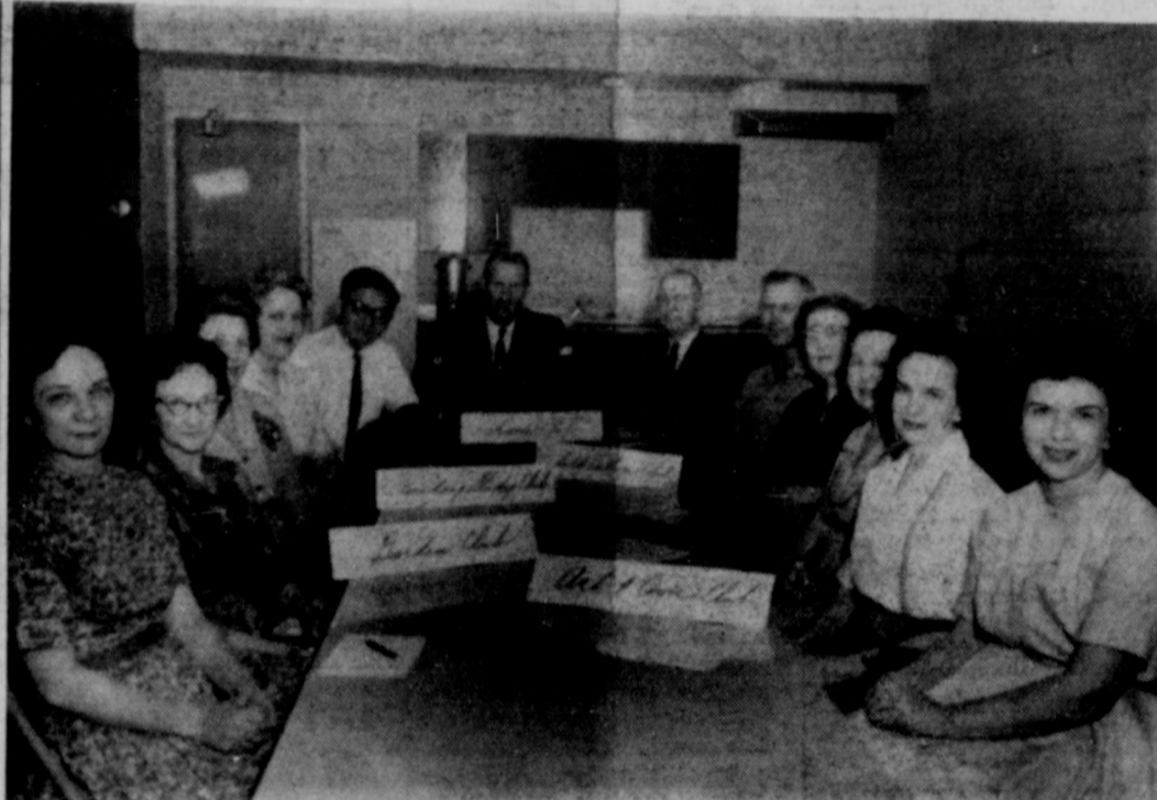
CIVIC CLUBS SUPPORT SCHOOL IMPROVEMENTS —Pictured here are representatives of five civic groups at a special meeting last Thursday afternoon as they made plans supporting the school improvement program. The five organizations represented were: Garden Club, Tuesday Study Club, Lions Club, Self Culture Club and Art and Civic Club.

All Pre-School children are invited to participate.