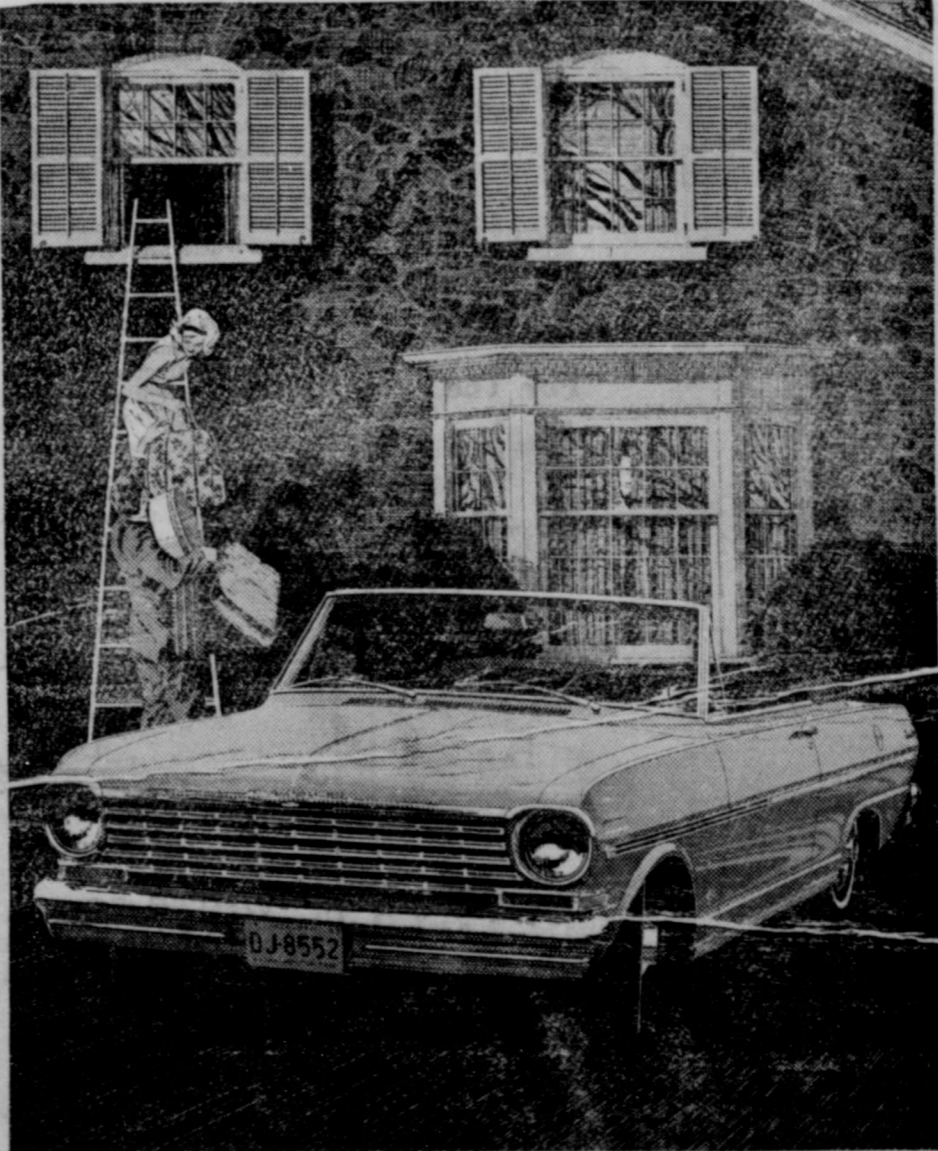
Chevy II Nova 400 SS Convertible above. Also available as SS Coupe. Super Sport equipment optional at extra cost. Also a choice of 10 regular Chevy II models.

All this plus Chevy II standard features: flush-and-dry ventilating system that helps remove rust-causing elements from rocker panels; battery-easing Delcotron generator; convenient self-adjusting brakes; longer lasting exhaust system; styling fresh as morning coffee, poured into a rugged Body by Fisher—and more. You'll find two can live as cheaply as one—when they're living it up in a new Chevy II! *Optional at extra cost.